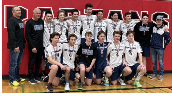
2023 SPAA Champions/Won bronze at zones

We had the best little cheer team at Provs – thanks to the ECS class