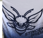
Back of shirt