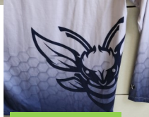
Back of shirt